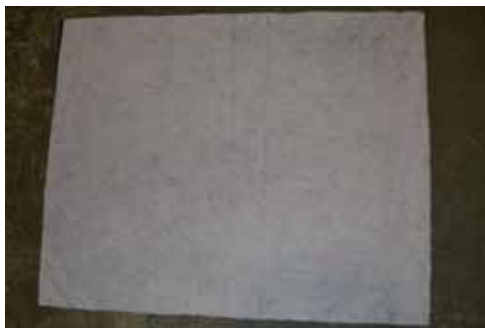
Mark the center line and a line 2.5" either side