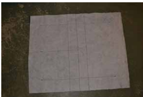
Steps #8 & 9