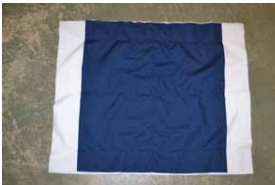
Frontside of the Inside Pocket lines