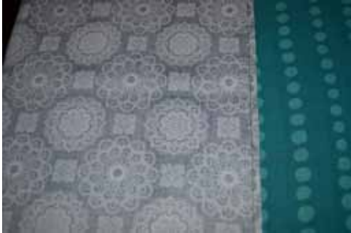
Material in Half with \frac{1}{4} " seam allowance