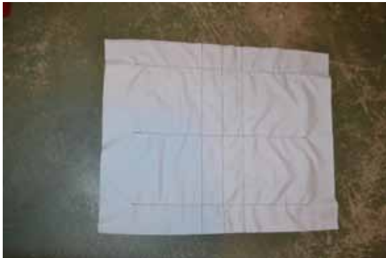
Backside of the Inside Pocket lines