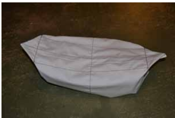
Bottom of the backside of the Inside of the bag