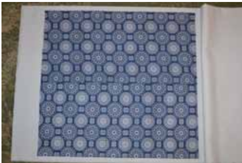
Seam is in the center