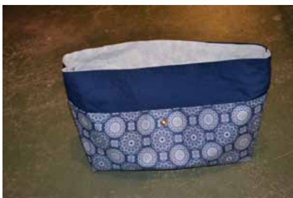
Outside of the bag