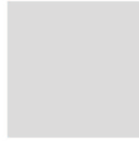
One Inch Test