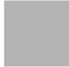
3 Centimeter Test